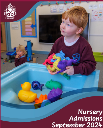
Nursery Admissions September 2024

"let your light shine before others, that they may see your good deeds and glorify your Father in Heaven." Matthew 5:16